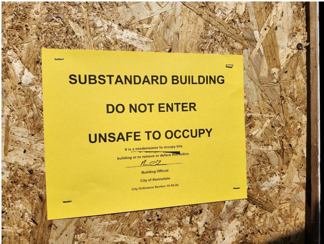
Notice Posted- Front Door

Following the order to vacate issued by the Building Board of Appeals on April 10, 2025, city staff visited 6713 Lindale Dr on April 14, 2025, to post notice. Staff met with James Hardy on-site who provided effective consent to enter onto the property. Staff posted yellow placards on the front and rear entrances of the structure (See Photos Below):