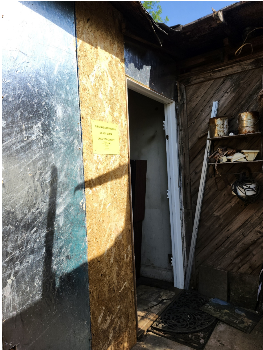
Notice Posted- Front Door