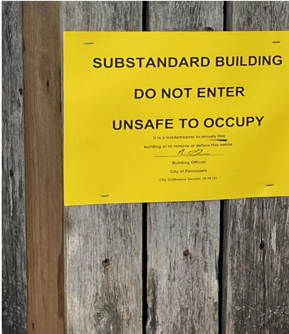
Notice Posted- Fence in Front of Property