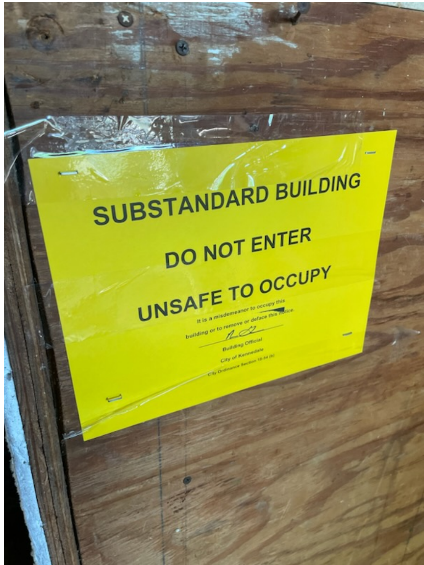
Notice Posted- Back of Property